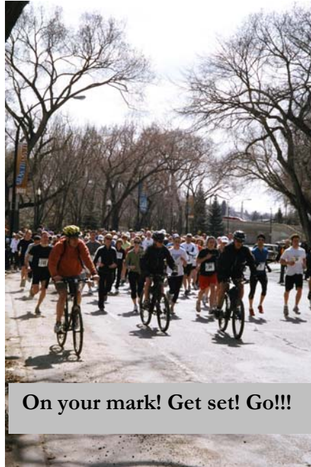
On your mark! Get set! Go!!!