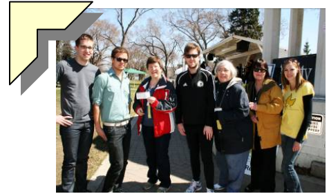
U of S Arts and Science Student Union members presenting a cheque for $2,005.00 to HOPE volunteers and staff.