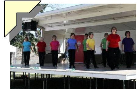
The Bridge City Cloggers "entertaining the troupes".