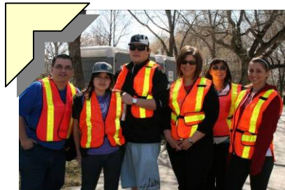
The SaskTel Pioneers served as volunteer marshals for the Race.