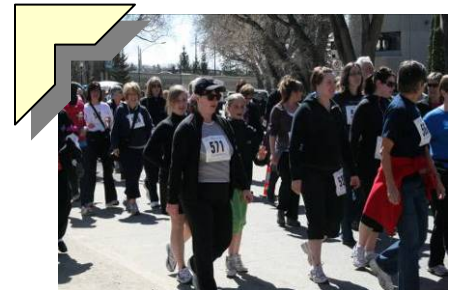
On your mark! Get set! Go! Participants heading out.